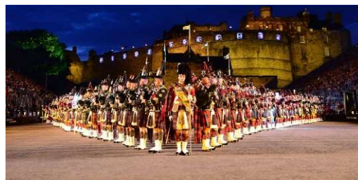
The Royal Military Tattoo

Full English Breakfast. This morning we catch a high-speed train, traveling first-class to Scotland. At 125 miles an hour, we arrive in plenty of time to enjoy an afternoon panoramic tour of Edinburgh. We’ll have free time to shop and explore the Royal Mile: Camera Obscura for photo buffs; literature fans can enjoy the charming Writers’ Museum which celebrates the great Scottish writers Robert Burns, Sir Walter Scott, and Robert Louis Stevenson. Then, we step down into Edinburgh’s hidden history with an underground tour in an area of the historic Old Town which has had a reputation for hauntings since at least the 17 th century. At night, we experience the splendour and pageantry of the annual Royal Military Tattoo, an event that people wait a lifetime to see!