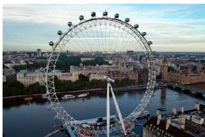
The London Eye

Full English Breakfast. This morning we get a private tour in Westminster Abbey, followed by a “Mark King Special”: Big Ben, the Houses of Parliament, the Cenotaph, and Downing Street, with stories and background info that you’ve never heard before. The afternoon takes us for an exclusive visit to the Czech Memorial Scrolls Museum to get an update on the fascinating story behind the rescue and renovation of 1,564 Holocaust Torah Scrolls and 400 Torah Binders. After a moving musical presentation, we complete the afternoon with a flight in the famous London Eye for a spectacular view of the city! Evening at leisure for last minute shopping before we head to Scotland, or enjoy one final night out in one of the world’s most exciting cities.