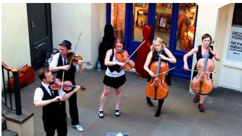
Buskers in Covent Garden

Full English Breakfast. This fantastic day