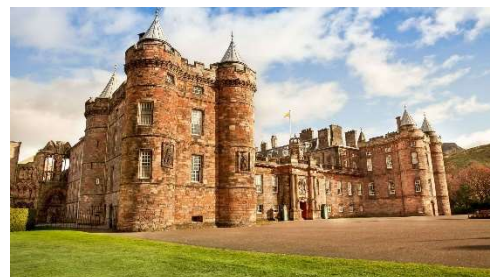
The Palace of Holyrood

Full Scottish Breakfast. We begin our day in the famous Edinburgh Castle, the inspiration for Harry Potter’s Hogwarts. See The Great Hall, St. Margaret’s Chapel, the One o’clock Gun, and more. We’ll next visit the Royal Yacht Britannia, where Queen Elizabeth II hosted kings and presidents, and relaxed on private vacations with her family. We tour Holyrood Palace before the evening takes us to our Farewell Banquet at Edinburgh Hebrew Congregation. Over a sumptuous dinner, we have a chance to meet representatives from the local Scottish Jewish community, enjoy a whimsical Scottish music cabaret, savour kosher haggis, and drink some l’chaims together!