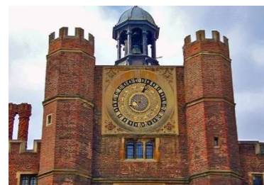
Astronomical Clock at Hampton Court