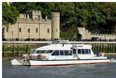
Cruise on the Thames