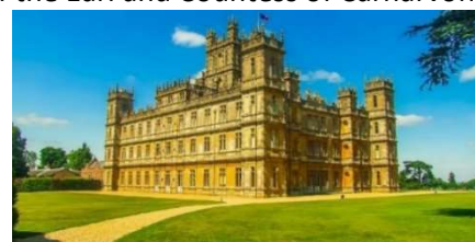
Highclere Castle: “Downtown Abbey”

Full English Breakfast. Today we step back in time on a visit to Highclere Castle, home of the Earl and Countess of Carnarvon, and location for the filming of the iconic television show Downton Abbey . Enjoy majestic Edwardian rooms familiar to fans of the show, see the Egyptian exhibit from the 5 th Earl of Carnarvon whose financing led to the discovery of King Tut’s tomb, or wander the perfectly manicured gardens. Finally, we will be treated to an exclusive personal Meet & Greet with the 8 th Countess, Lady Carnarvon. Back in London, evening at leisure to discover your new favourite restaurant, take in a show, or experience any of the many fabulous offerings of London’s nightlife.